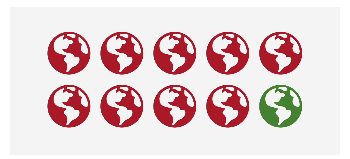
FIGURE 1 NINE OUT OF TEN COUNTRIES ARE IMPLEMENTING POLICIES LIKELY TO INCREASE ECONOMIC INEQUALITY

The Commitment to Reducing Inequality (CRI) Index 2024 offers powerful new, up-to-date evidence of this deeply concerning trend. Reviewing the actions of 164 governments across three areas critical to reducing inequality – social services, taxation and work – for the first time since the CRI began in 2017, we identify strongly negative trends for the overwhelming majority of countries. Combining data from these three pillars, at least nine out of ten countries are implementing policies and actions likely to increase economic inequality.